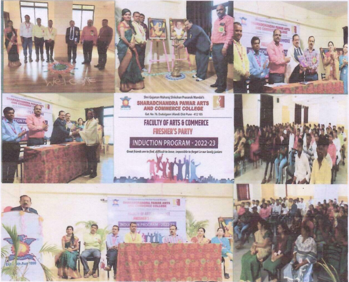
Hall Decoration, Sitting arrangement done by student's