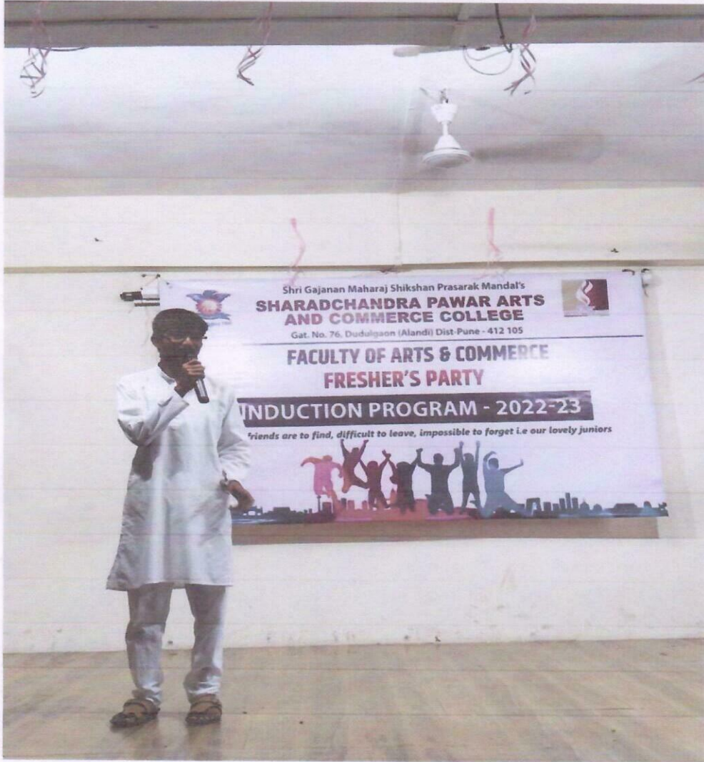
Anchoring done by college student